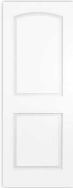
#21PR Arched Top 2-Panel

Roughly translating to elevate or to raise , Levante™ captures the essence of our new line of raised panel stile and rail doors. Crisp panel detail, engineered LVL stiles for performance and EasyPrep primer truly set it apart from the alternatives. It offers the panel designs people want – ready to paint. You won't find this door anywhere else, much less at such an unbeatable value.