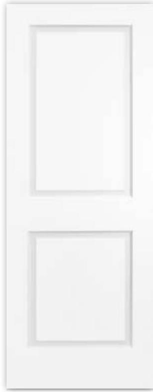
#22PR Square Top 2-Panel